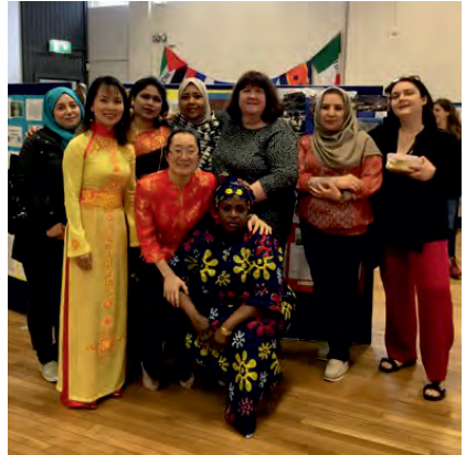
Intercultural Day at Portlaoise FETC

Literacy and numeracy can be improved on by joining one of the many courses available in our Centres, across all levels, depending on your needs and interests. This includes art, computers, childcare, crafts, construction, engineering, gardening, office and retail skills.