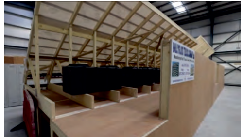
Attic insulation retrofit rig.

The first programme was provided specifically for Bord na Móna employees, whereby trainees were facilitated to be released from their usual work to attend the training. Upon successful completion of this programme, trainees will receive a QQI Level 5 minor award in Thermal Insulation Installation.