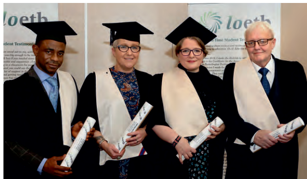
Healthcare Support QQI Level 5 Graduates, receiving their awards at the 2019 Annual Awards Ceremony.

Course completion is reliant on Garda Vetting Process.