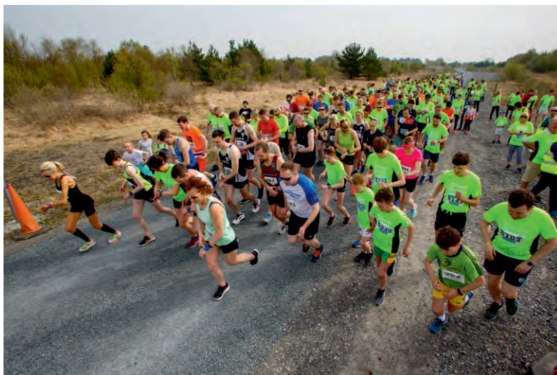
Family and friends joined staff members in a 5k/10k run/jog at an LOETB Staff Wellbeing Day in Mount Lucas - April 2019.

Course completion is reliant on Garda Vetting Process.