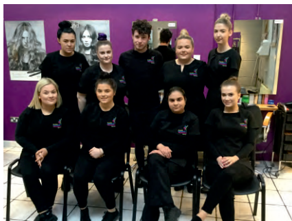
Learners at Tullamore CTC prior to their VTCT Diploma in Hair & Beauty assessment.

Modules Cut Men's Hair | Cut Facial Hair | Client Consultation for Hair Services | Health and Safety Practice in the Salon | Customer Service | Information Technology Skills | Personal Effectiveness | Team working | Health and Safety Awareness | VTCT – Salon Reception Duties