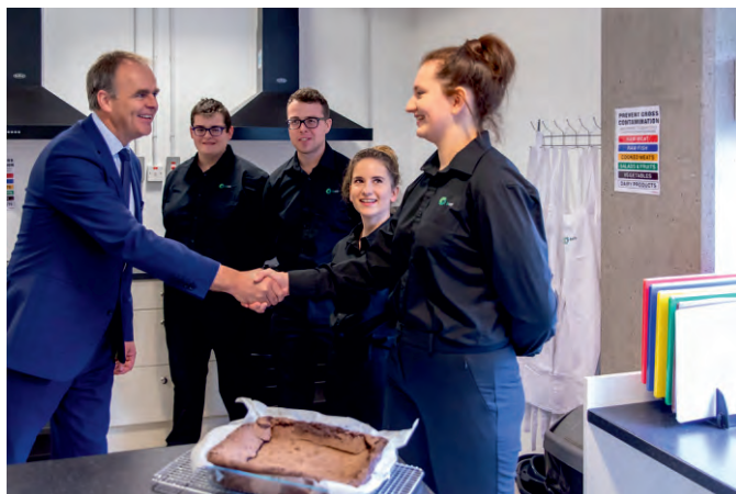
Minister for Education & Skills Joe McHugh, TD meeting the Hotel & Restaurant learners during his visit to Tullamore FET Centre, October 2019.