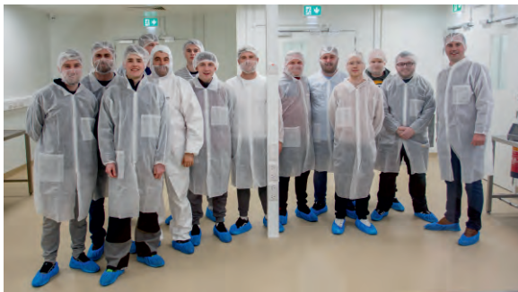
Learners participating in Cleanroom training.