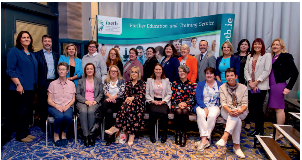
Tullamore FETC Staff Members, Awards Ceremony 2019

Modules Professional Cookery Techniques | Effective Team Working | Principles of customer service in hospitality, leisure, travel & tourism | Health & Safety in catering and hospitality | Work Experience | Barista Skills | Legislation in food and beverage service | Preparing Meat & offal | Preparing fish & shellfish | Produce fermented dough products | Food Service