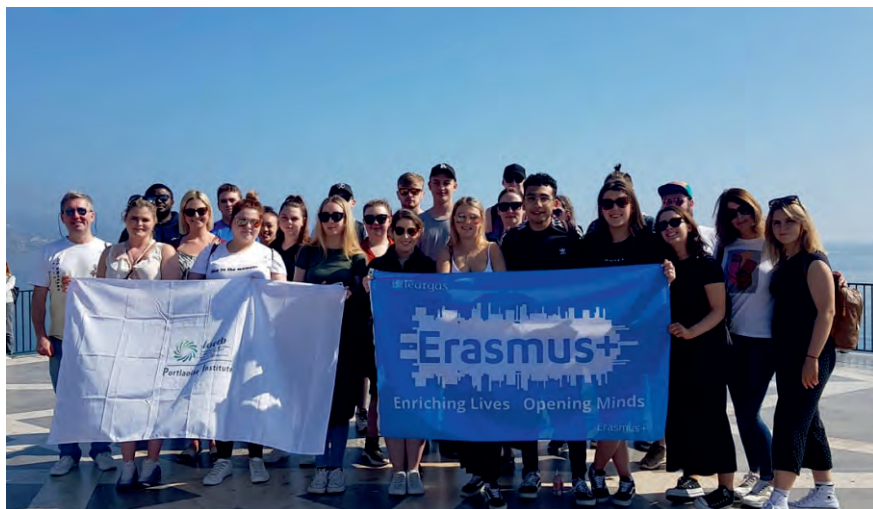
Learners enjoying their two-week Erasmus Work Placement in Malaga, Spain.