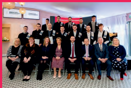
Apprentices Graduation 2020

A full list of all apprenticeships on offer can be found on www.apprenticeship.ie