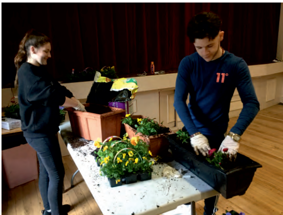
Clara Youthreach learners working together.